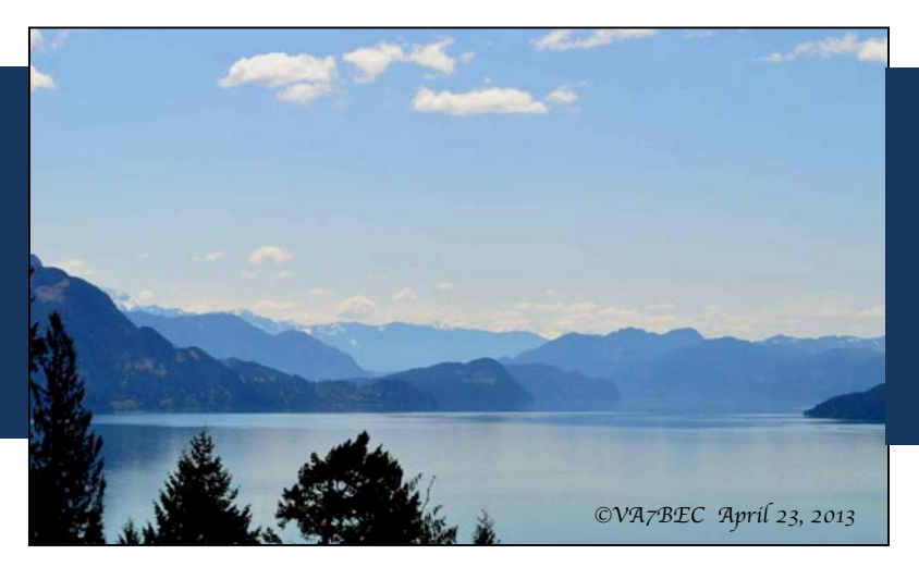
Back country, east of Harrison Hot Springs